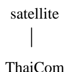
Figure 3 Line diagram linking satellite and ThaiCom

Hyponymy implies a "relation that holds between a specific or subordinate and general or superordinate concept" (Cicourel, 1991: 40). Thus a superordinate term may contain several hyponyms. In a similar way, we can talk about topics containing various subtopics (e.g. Hudson, 1980; van Dijk, 1977). Since we are considering themes in our analysis, we can say that ThaiCom is a subtopic of satellite and this relationship can be represented in a line diagram as in Figure 3: